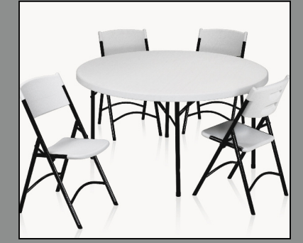
Users of all shapes and sizes appreciate the stability and strength of UltraLite folding chairs. These chairs are easy to carry because of the innovative molded backs.