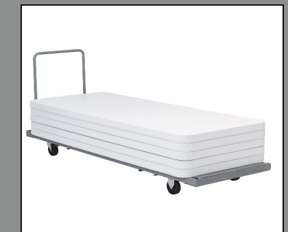
Although easy to carry, optional table trucks make storage mobile. Tables stack easily and store flat anywhere.