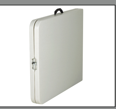
The 30"x72" table only can be ordered in a fold-in-half version which features a latch and carrying handle to allow for convenient transport.