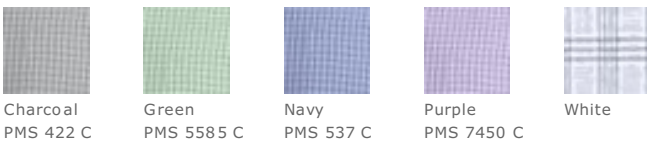
Charcoal PMS 422 C Green PMS 5585 C Navy PMS 537 C Purple PMS 7450 C White