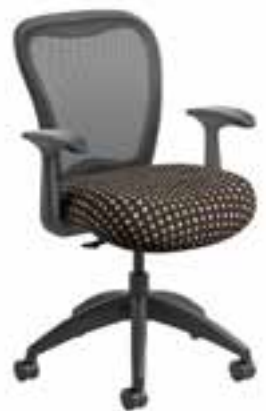
5900 PATTERN COLLECTION | KINNEY KIN4 | Mineral