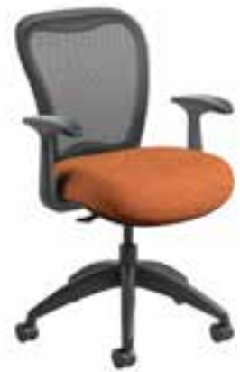
5900 PATTERN COLLECTION | LINE UP LINE06 | Spice