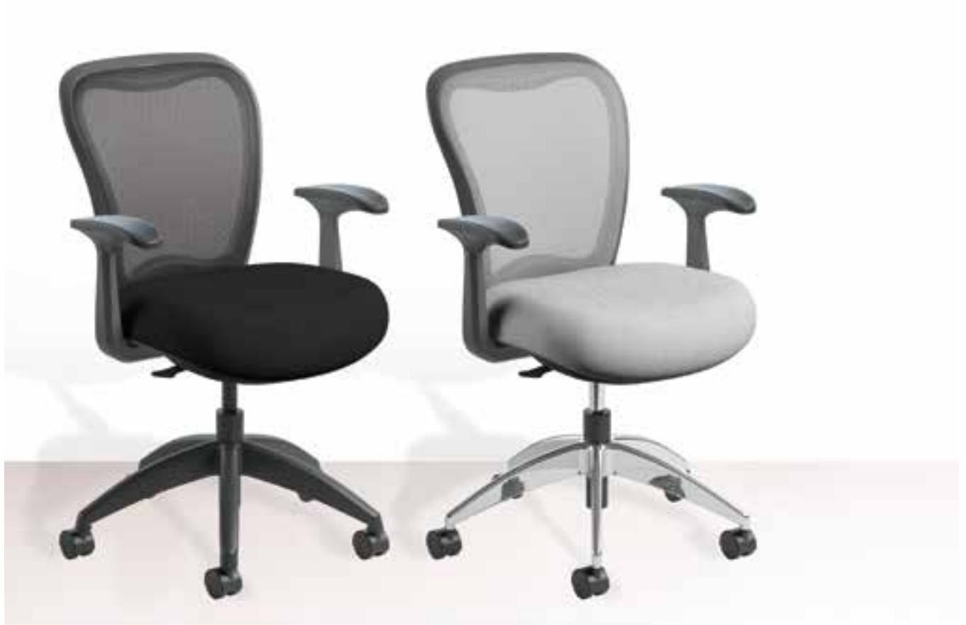
5900 Mid Back Task

MXO™ chair series is the perfect solution for any conference room, meeting room or setting that requires a clean organized look. No matter what options or features you pick, your chair will always return to the default ready position to keep the working space organized for the next group.