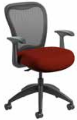
5900 SOLID COLLECTION | VOX VOX17 | Ruby