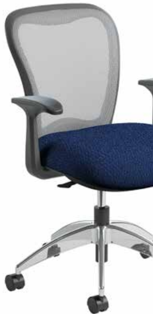
5900SM-CH Silver Mesh Back & Chrome Base STRETCH COLLECTION MOGULS | M02231 | Navy