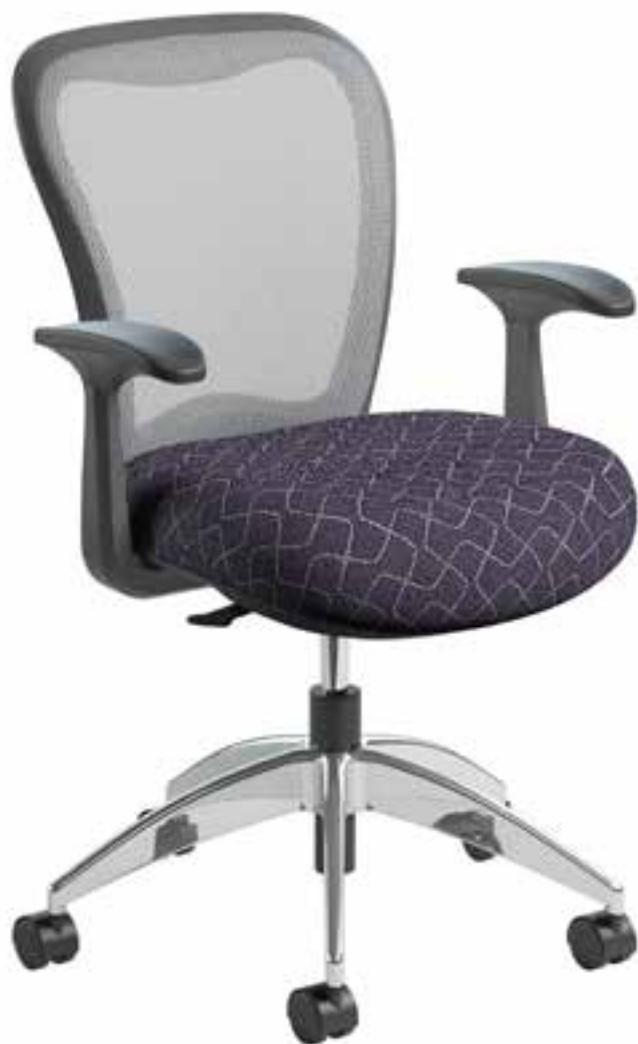
5900SM-CH Silver Mesh Back & Chrome Base PATTERN COLLECTION AXIS | AXIS04 | Denim

The MXO™ series can be upholstered using any of our high quality textiles and vinyls in a wide range of colors and grades.