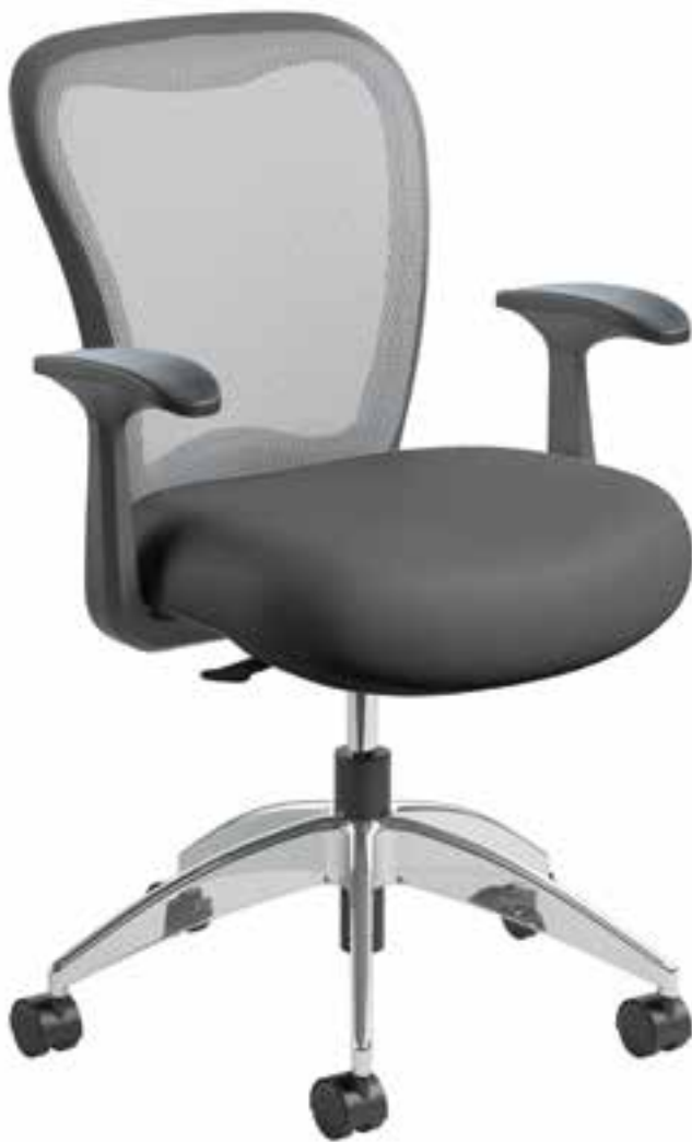
5900SM-CH Silver Mesh Back & Chrome Base LEATHER PLUS COLLECTION MADRAS | 435 | Clay